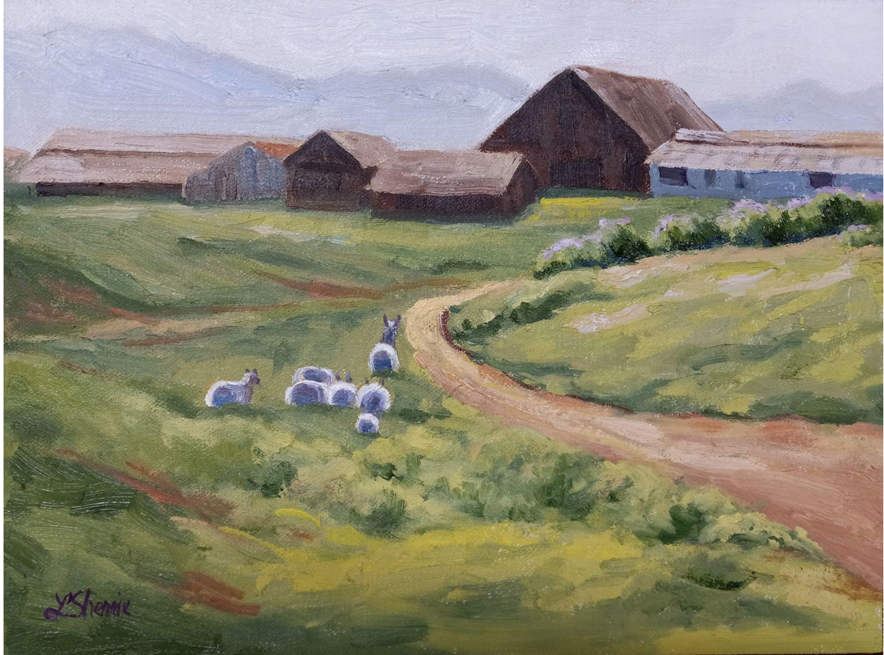
Coastal Farm, oil on canvas, 9" x 12" by Laurel Sherrie