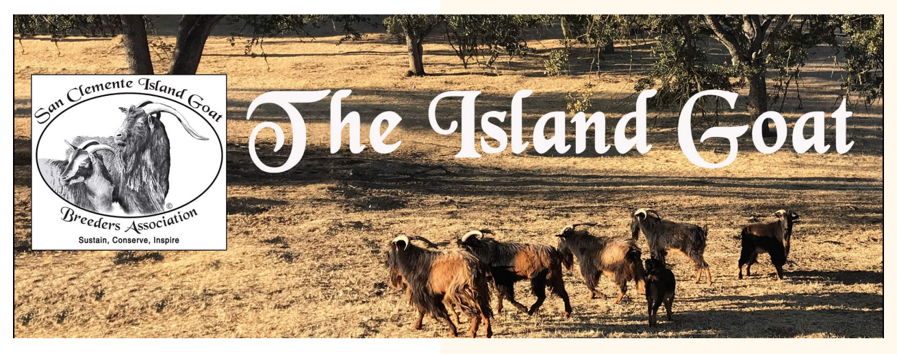
Newsletter of the San Clemente Island Goat Breeders Association