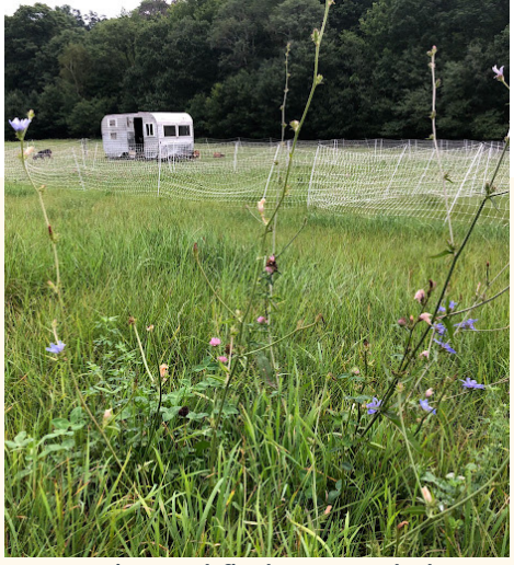
Be creative and find ways to help you save a couple bucks. My friends gave me their old camper. I gutted out the camper, put a milk stanchion inside and now use it as portable goat housing. While investing in a new jack and using old materials to make a partition.

The answer is all of them, of course!! Who doesn't want to keep adding these wonderful goats not only to their own personal herd but also to the world population?