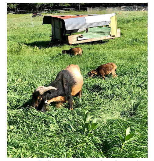
Some of the SCI goat bucks enjoy luscious, long grass. This area housed pastured poultry just a month prior to them grazing in this spot. That nitrogen made the grass grow back quickly and more lush than before!