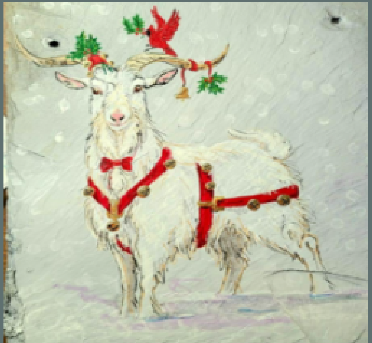
Autumn Dufresne. "Yule Goat" Acrylic paint and alcohol inks slate.