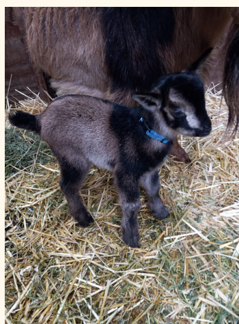
Bella Vita Fiorello. Jennifer's first buckling.